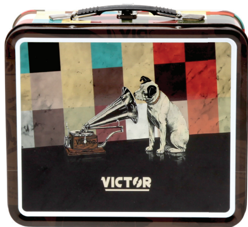
FULL SIZE LUNCHBOX INCLUDED